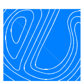
EXHIBIT SKETCH 20' WATER LINE EASEMENT

earthworx, llc 4300 North Access Road, Suite C Chattanooga, Tennessee 37415